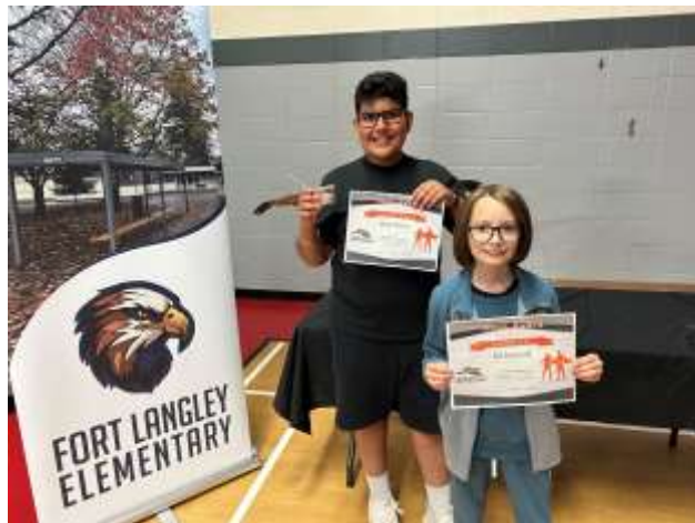
23 - May Hawk Award winners