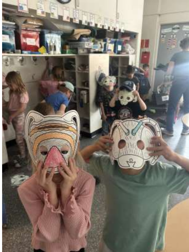
17 - Students in Ms. Bendo's class show off their mask creations