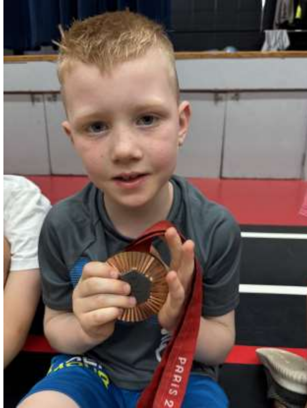
20 - Ms. Harder's grade 1 students found additional opportunities to explore what courage means and looks like....