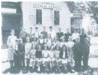
This was not the first class but it was an old class from 1950.

4. TUG-O-WAR was a station where 2 teams work together to pull a rope in their direction while the other team also pulls the rope in the opposite direction. The team that pulls it over their own line wins.