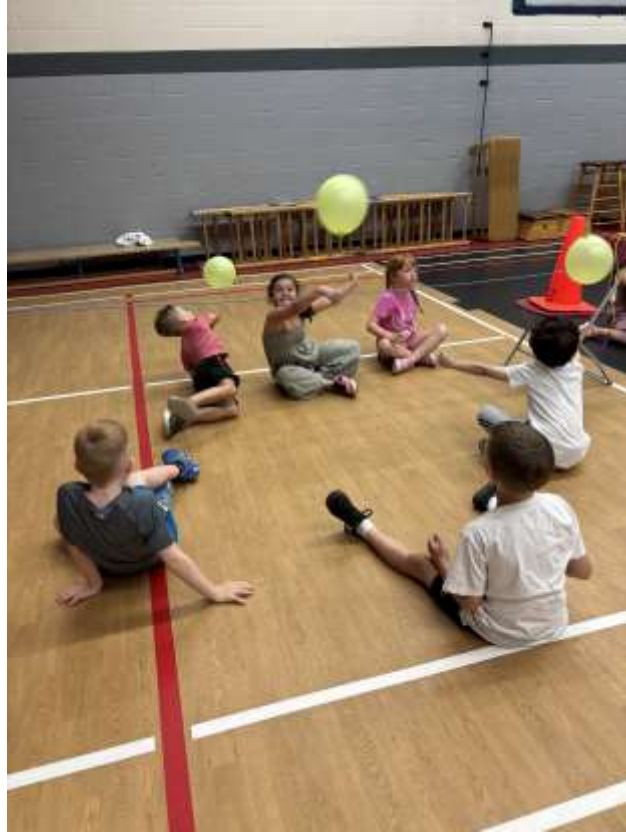
22 - Sitting volleyball lessons to learn empathy and understanding