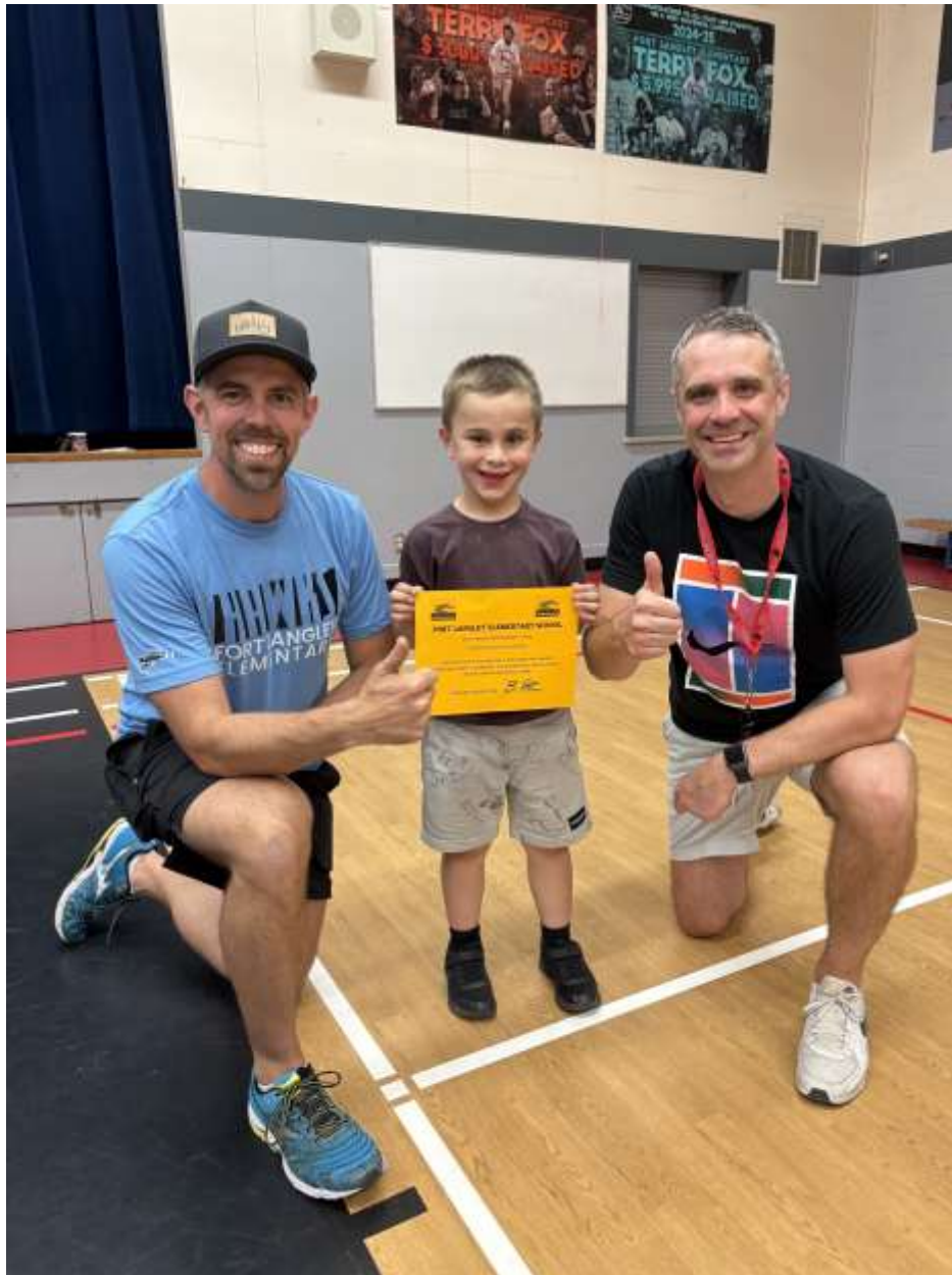
27 - Tov took part in our Mini-Hawks basketball program