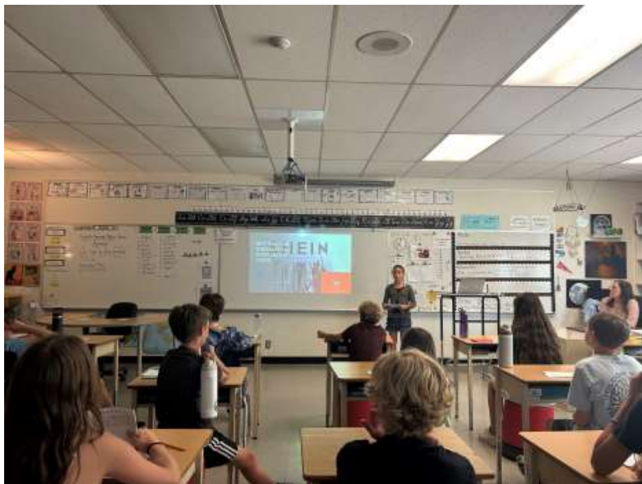
18 - It was an honour and pleasure to listen to Div 2's oral presentations/speeches last week. These were top notch and very impressive across the board.