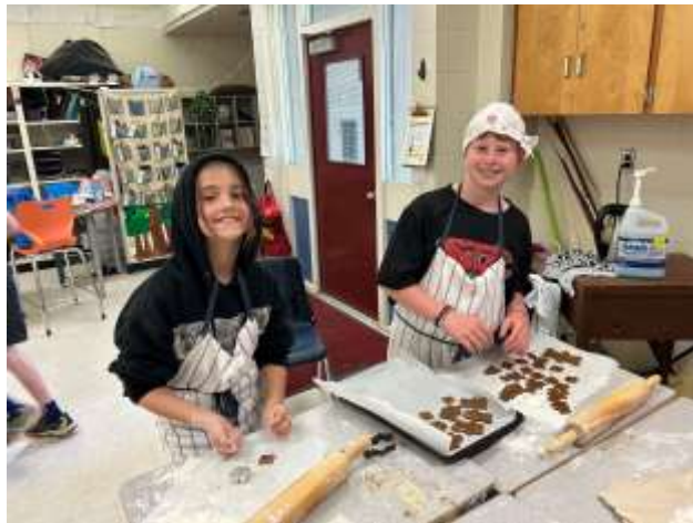
24 - Cookie creations in Div. 15