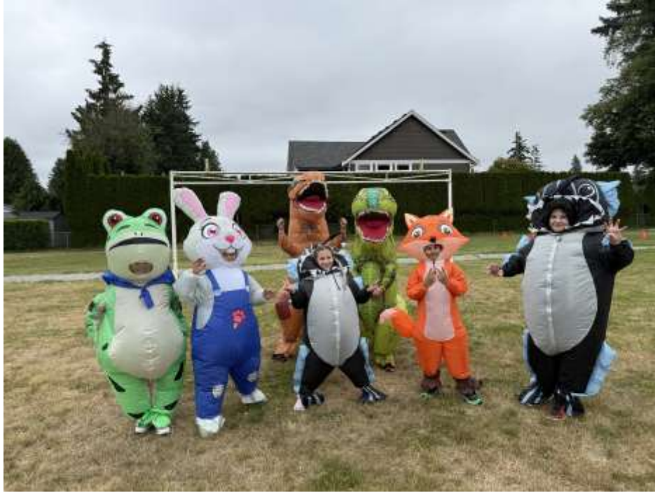
2 - Inflatable Halloween Costume Race