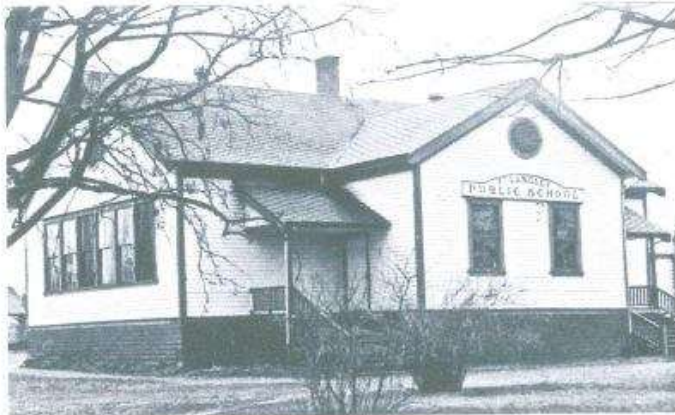
Fort Langley Public School.