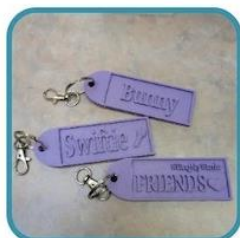
Grade 5 students made keychains as a memento of their time at Willoughby