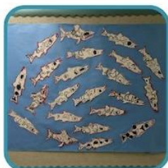
Grade 1 students made artwork using Indigenous shapes that were created on the 3D printer