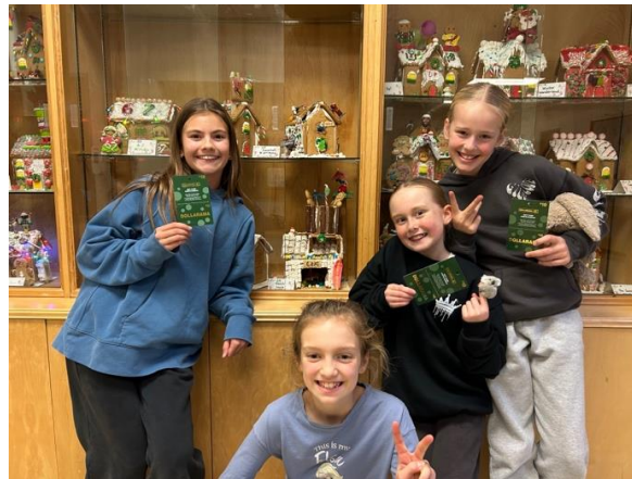
Grade 5 Winners of Gingerbread House Contest