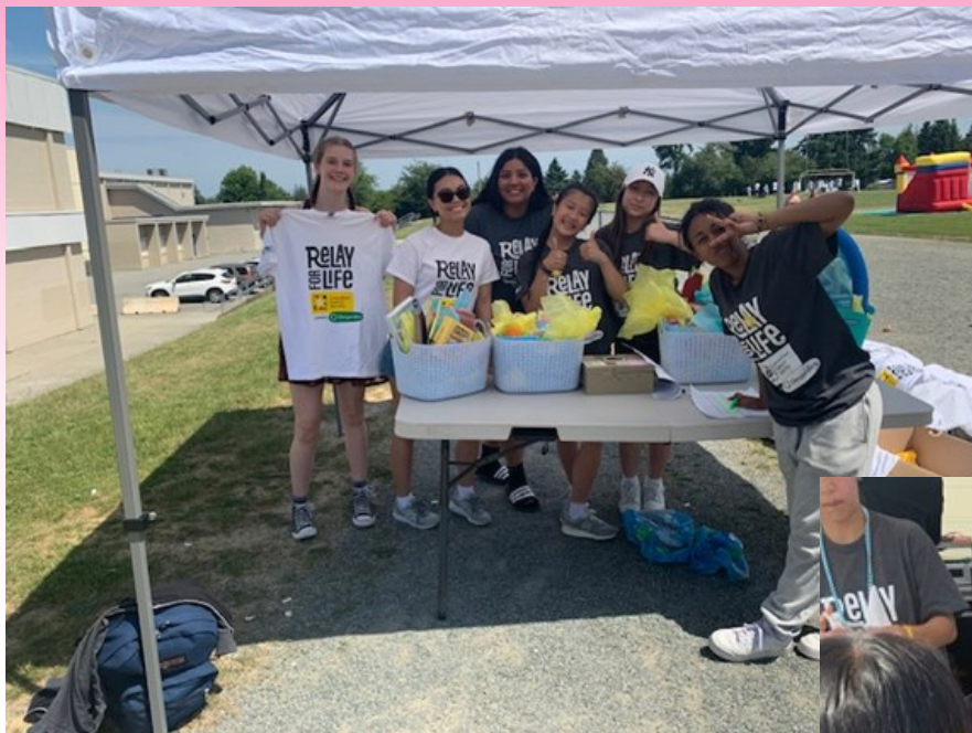
Relay For Life