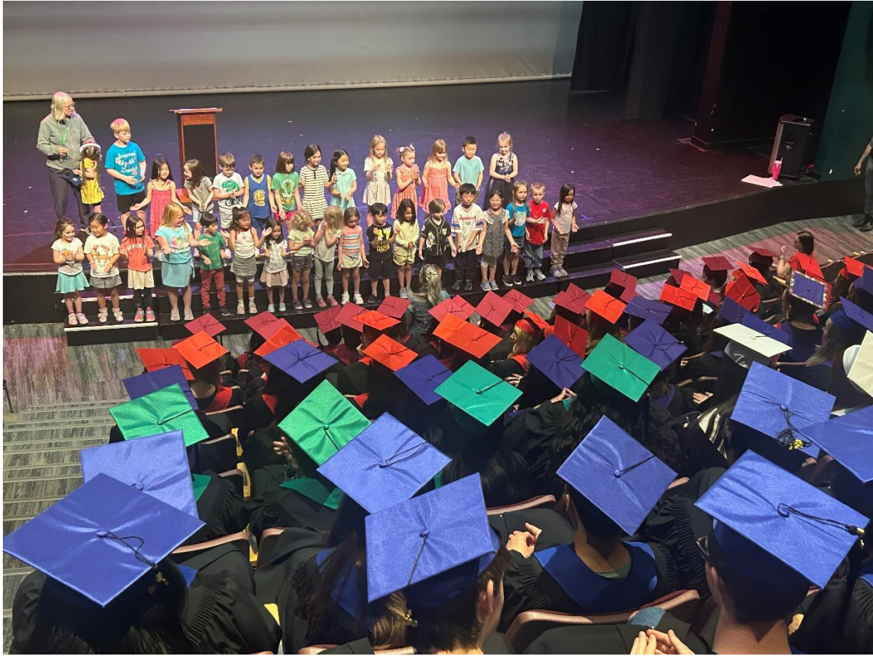
Our Kindergarten students surprising Graduated with a wonderful performance at their grad rehearsal!