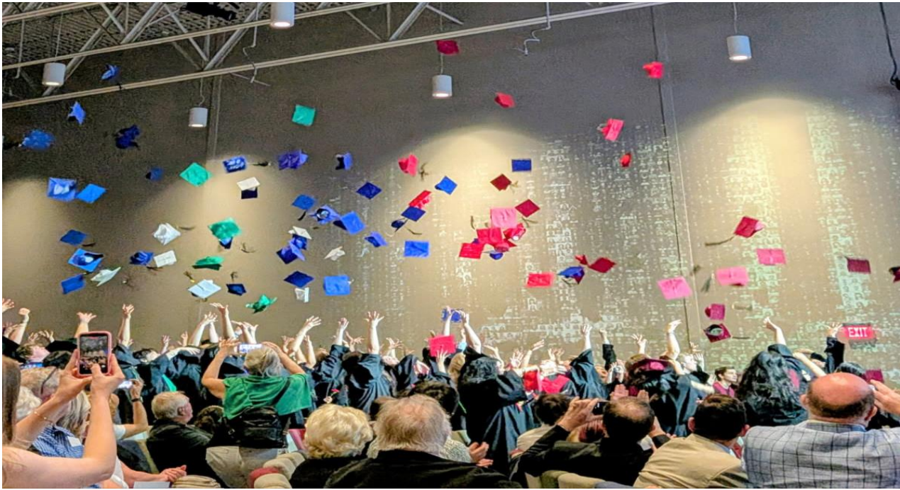
Hat's off to our graduates!