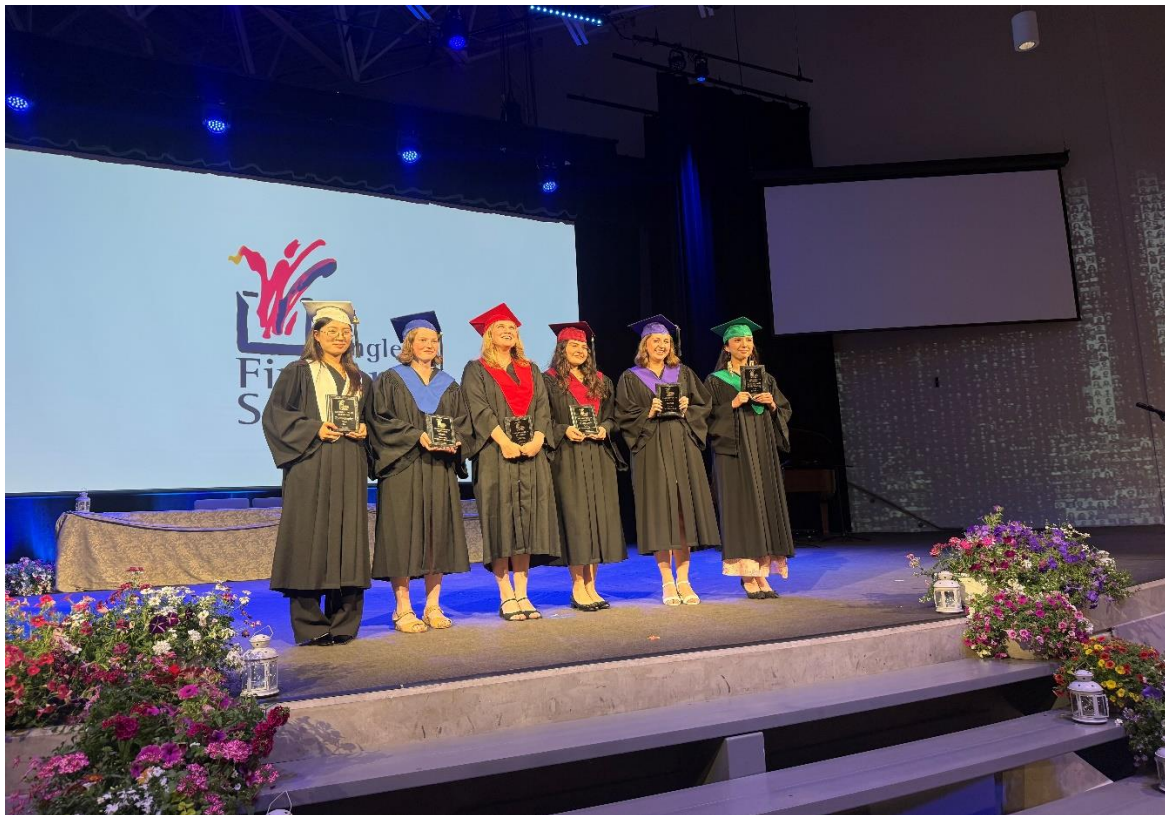
Congratulations to our Valedictorians!