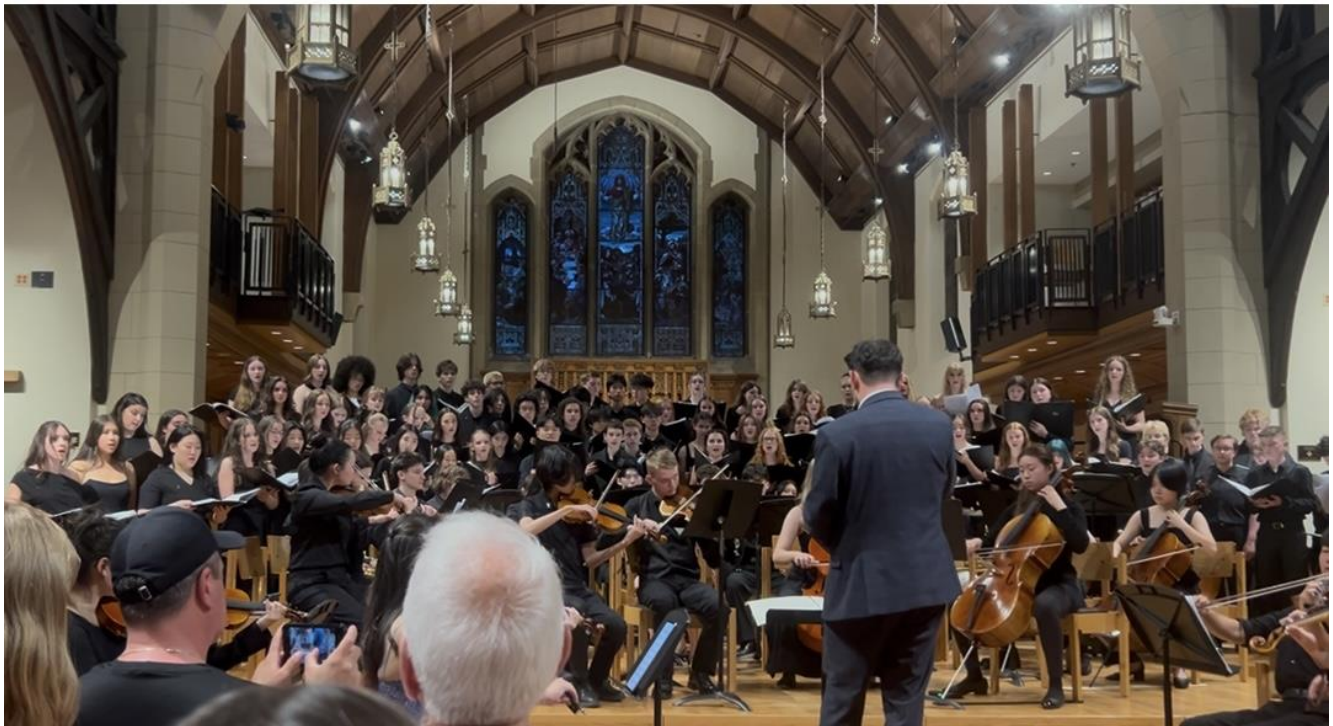
Such a beautiful Night of Music at the Christ Cathedral Church on June 2 nd .