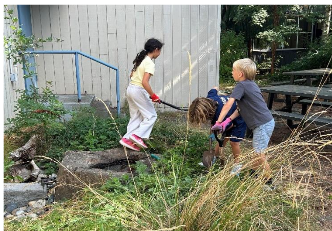
Grade 3s Cleaning up the Courtyard