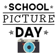
PHOTO DAY HAS CHANGED....

The Aboriginal Self Identification forms were sent electronically with the Parent Letter in August as well as a paper copy with the student verification forms. This is very TIME SENSITIVE , and the forms are required by Friday, September 12 th if you are self-identifying.