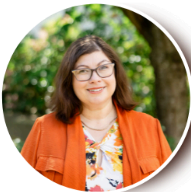
OLIVIA DPAC REP