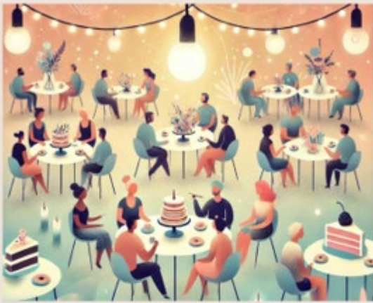
TABLE TALKS ALDERGROVE

SUBSTANCE USE & YOUR NEIGHBOURHOOD A DESSERT & DIALOGUE EVENING