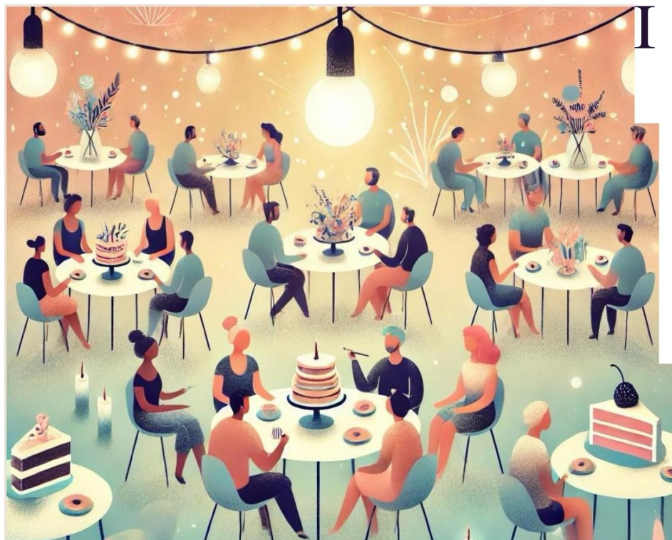
TABLE TALKS ALDERGROVE

SUBSTANCE USE & YOUR NEIGHBOURHOOD A DESSERT & DIALOGUE EVENING