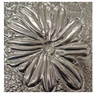
Grade 8 Social Studies Medieval Projects